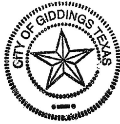
EXHIBIT F PAGE 3